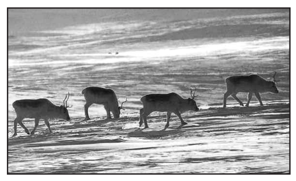
Peary Caribou in the Arctic.

then 1%, the 1.5%) each year; such a law is called an Energy Efficiency Resource Standard or Energy Efficiency Portfolio Standard.