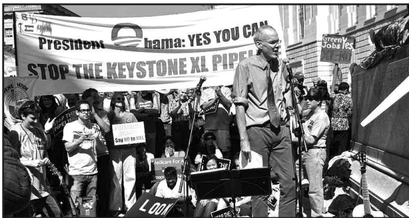
There were about 300 vigils across the US on February 3, 2014, to protest the Keystone XL pipeline.

On behalf of the Missouri Coalition for the Environment , we are fighting the Corps of Engineers over the Environmental Assessment it issued to Enbridge allowing the bitumen to cross the Mississippi River north of Hannibal, Missouri. In addition to contributing to climate change, this crossing is bad because people, including those in St. Louis, rely on the Mississippi River downstream from this crossing for their drinking water. Enbridge has had leaks in its pipelines before, fouling drinking water, and no pipeline is immune from leaks for all time. Great Rivers and the Missouri Coalition for the Environment will continue fighting this pipeline on all possible fronts.