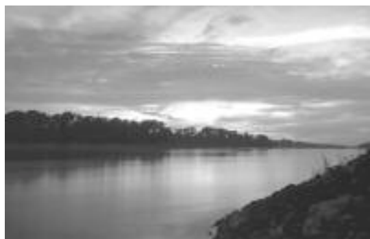
The Missouri River near Jefferson City

impact of the proposed levee. Four years and three court challenges later, the district court agreed with Great Rivers. This is the first time any court has said that the Corps must look at the cumulative impacts of levees and other flood control structures on flood heights. ❖