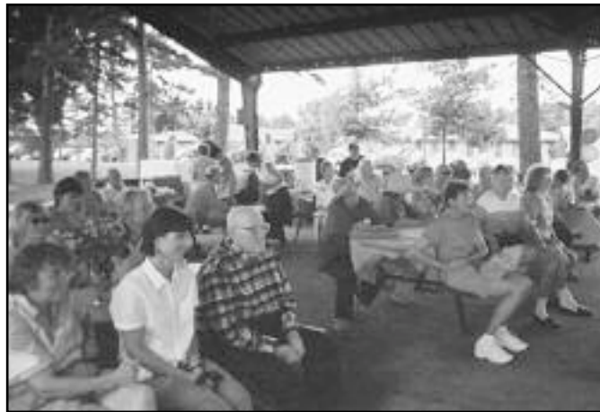
Residents of Rolla gather in Buehler Park to celebrate the victory!

Court Restores Citizens' Rights to Preserve Public Parks