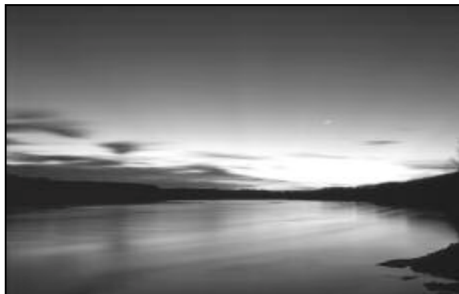
The Missouri River at Jefferson City will remain free-flowing for now.

Corps Can No Longer Refuse to Evaluate the Cumulative Impacts of Levees on Flood Heights